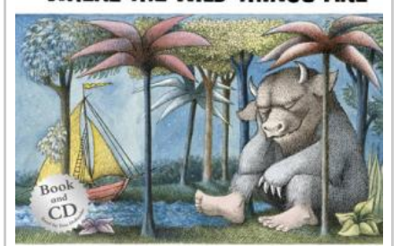
STORY AND PICTURES BY MAURICE SENDAK